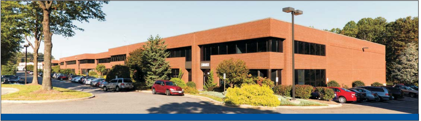
Rear Loading Area