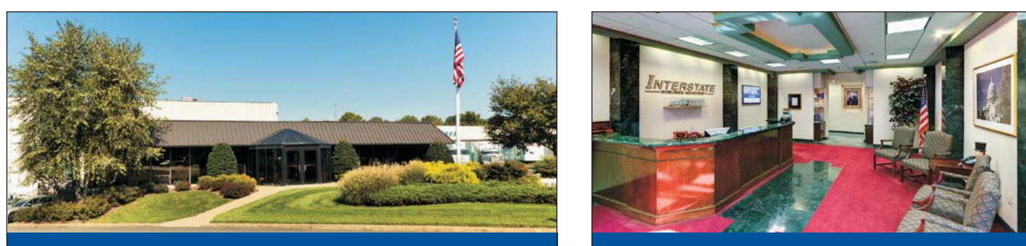
All information deemed reliable, but not guaranteed